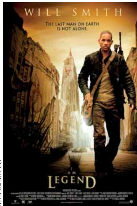
Warner Brothers Pictures

However, what is most interesting about this film is not the potential versatility of the figure of the scientist, but that a more complicated representation was cut from the official version. I am legend did not always have the ending described above. In fact, it started with a very different narrative arc