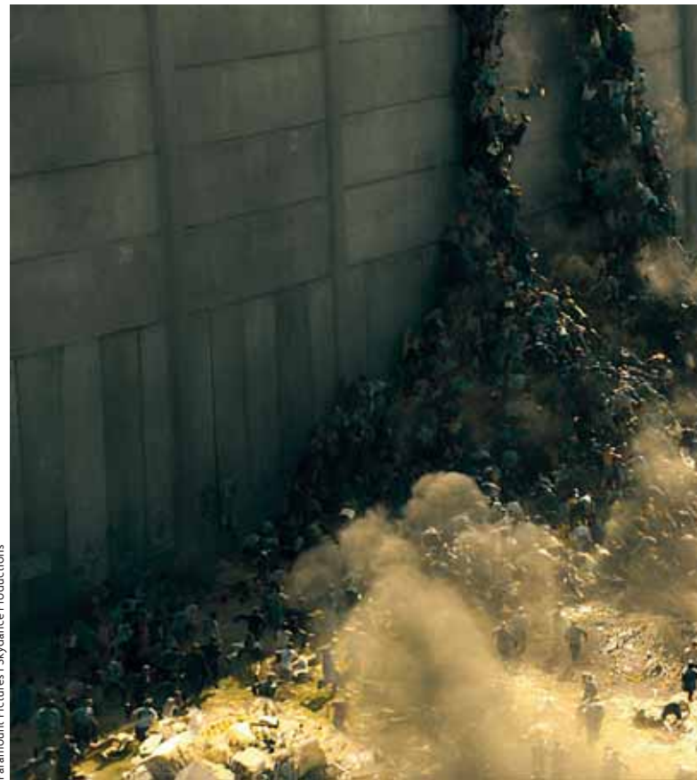
Paramount Pictures | Skydance Productions

In light of this difference between the zombie narratives of the past and present, there is an argument to be made that the contemporary zombie film reflects a straightforward fear of a viral pandemic in our current era, revealing our anxiety about both the power and the ineffectiveness of modern biomedical sciences. In this article, I offer a close reading of three recent movies that tell the story of fast-moving, virus-infected zombies and the collapse of civilization. These movies are not intended to represent all contemporary zombie narratives; they are just three revealing examples. My interest in examining these movies is not just to highlight the fear of contagious disease that they reflect and promote among an increasingly mobile and interconnected global population in an age of bioscience, but to tease out the specific way in which each movie portrays the figure of the scientist. As German sociologist Peter Weingart (2003) suggests, the ethos of the scientist developed through «images, clichés, and metaphors» in fictional film can tell us much about the relationship between science and society. So what does the portrayal of the scientist in contemporary zombie movies tell us about the way we think about scientists in our modern world?