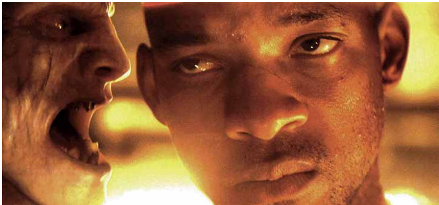
Warner Brothers Pictures

An alternate ending was shot for I am legend , but it did not test well with audiences, so it was changed. In that version, the main character respected the Dark Seekers' lives.