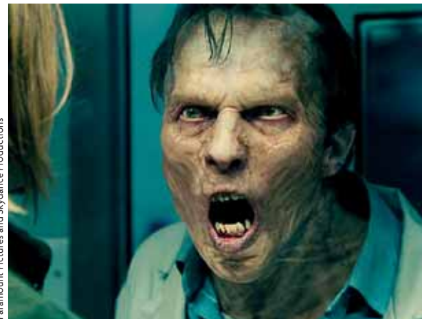
Paramount Pictures and Skydance Productions

A number of explanations have been offered for this outbreak of apocalyptic narratives featuring hordes of the undead and the breakdown of civilization. The rise of the genre is said to reflect xenophobic anxiety about immigration and the fecund reproduction of the dark «Other» in a so-called «post-racial» era. On the left and above, stills from the film World War Z (2013).